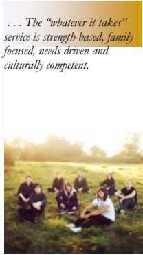
... The "whatever it takes" service is strength-based, family focused, needs driven and culturally competent.